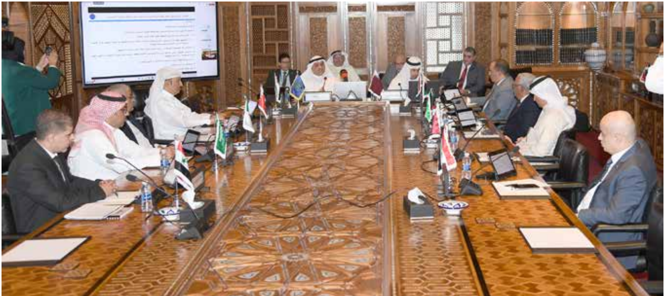
• OAPEC EXECUTIVE BUREAU HOLDS ITS 171ST MEETING , STATE OF KUWAIT

preparing the final drafts of the new operational model and the regulations and systems mentioned in the study related to the second phase, according to the updated strategic objectives.