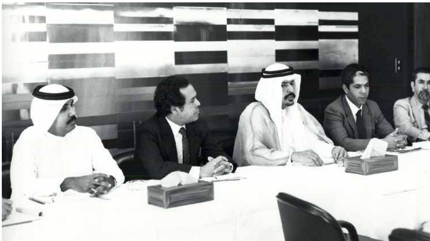
• First Energy Conference, Abu Dhabi, 1979

could easily find other sources of supply to meet their oil needs. In contrast, the producing countries could not do without the almost sole income generated by oil production. Moreover, the limited importance of oil at that time did not make this decision have tangible effects on the international level. However, despite the ineffectiveness of this decision, it was at the time a warning signal and was certainly a starting point for subsequent similar decisions.