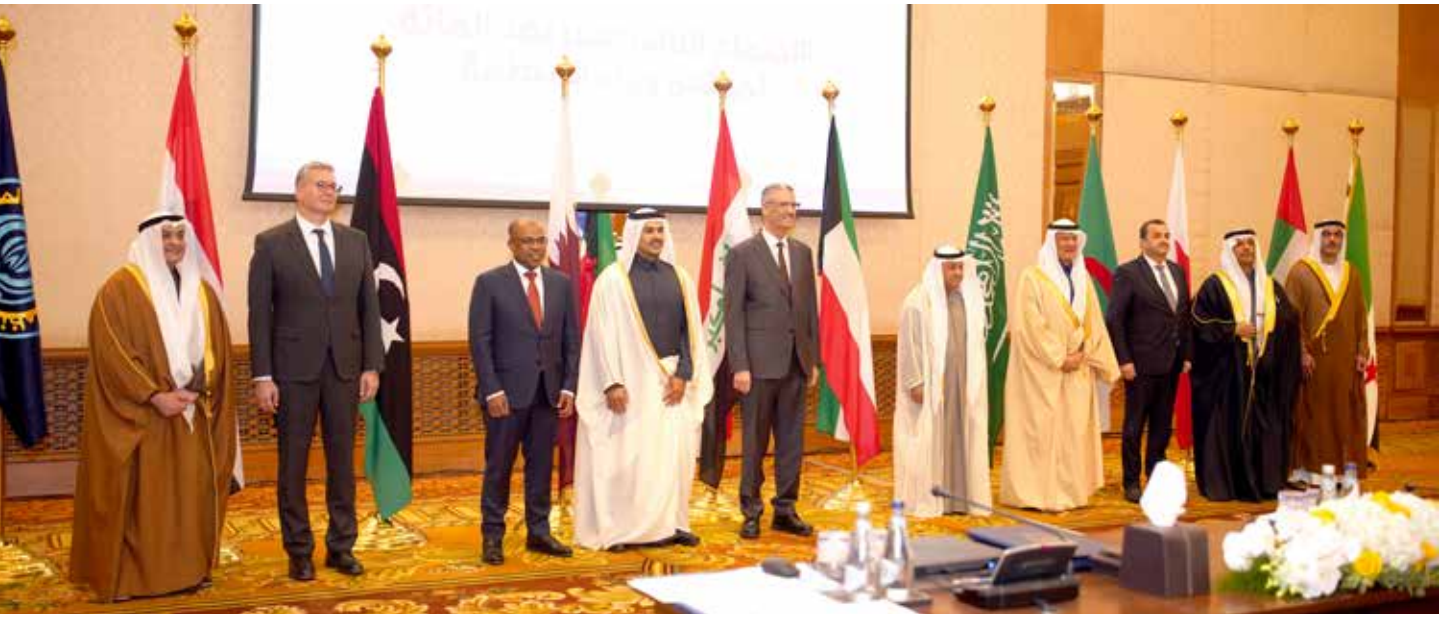
• THE 113TH MEETING OF THE COUNCIL OF MINISTERS OF THE ORGANIZATION OF ARAB PETROLEUM EXPORTING COUNTRIES (OAPEC), 15 DECEMBER 2024, STATE OF KUWAIT