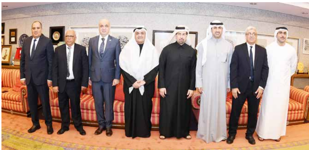
• THE 172ND MEETING OF OEAPEC EXECUTIVE BUREAU PRIOR TO 113TH MINISTERIAL MEETING, 14 DECEMBER 2024, STATE OF KUWAIT

organization development project study, with the referral of the proposed names and logos for the council to decide on, and the adoption of the final draft of the amendments to some provisions of the founding agreement and the protocol of immunities and privileges of the organization and its employees, with the General Secretariat tasked with referring them to the member states to take the necessary legislative measures to ratify them. The General Secretariat was also tasked with preparing the draft report for the second phase of the organization development project study, including its vision for the plan and timeline for implementing the initiatives mentioned in it, including the new operational model and the modified and updated regulations and systems. They were referred to the office upon completion for review and to take the necessary measures for their adoption.