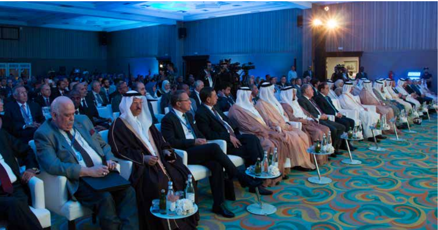
• 11th Energy Conference, Marrakech, 2018

evolving international and regional pressures.