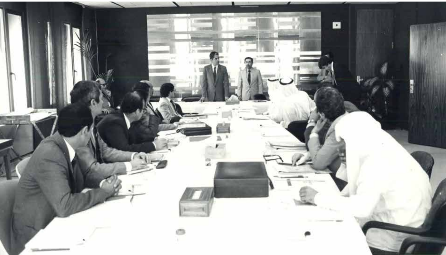
• First Energy Conference, Abu Dhabi, 1979