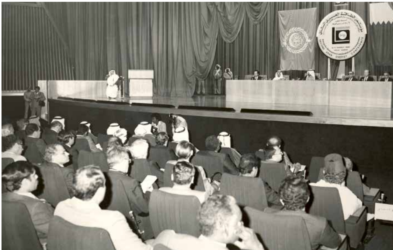
• 2nd Energy Conference, Doha 1982