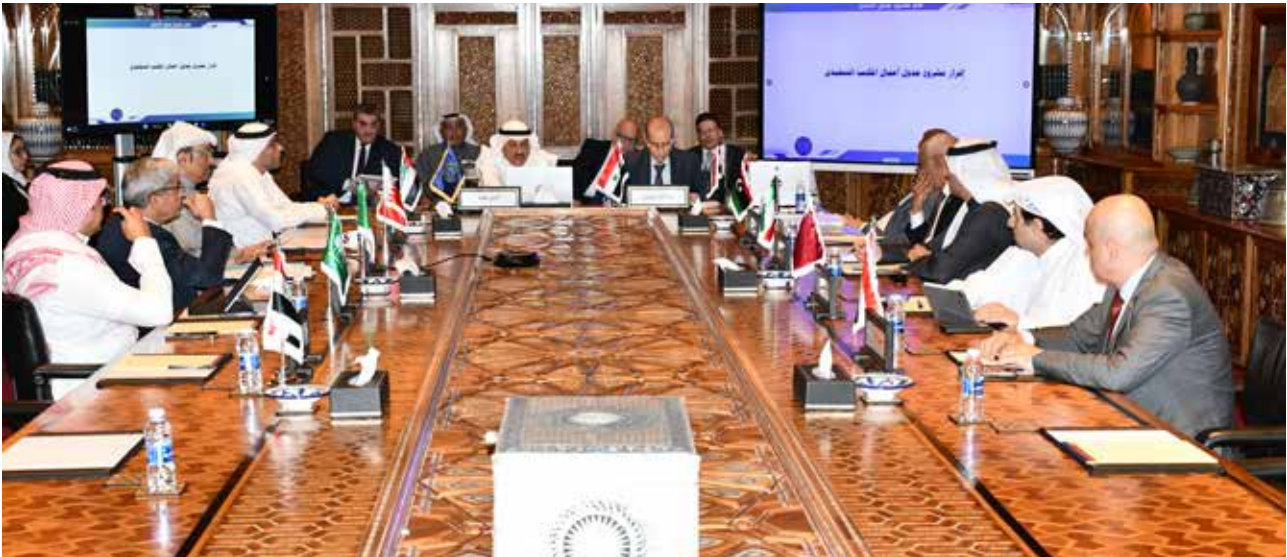
• THE 164TH MEETING OF OAPEC EXECUTIVE BUREAU, STATE OF KUWAIT

2023, the office issued its recommendation No. (K 167/2023 - W) which included the following: