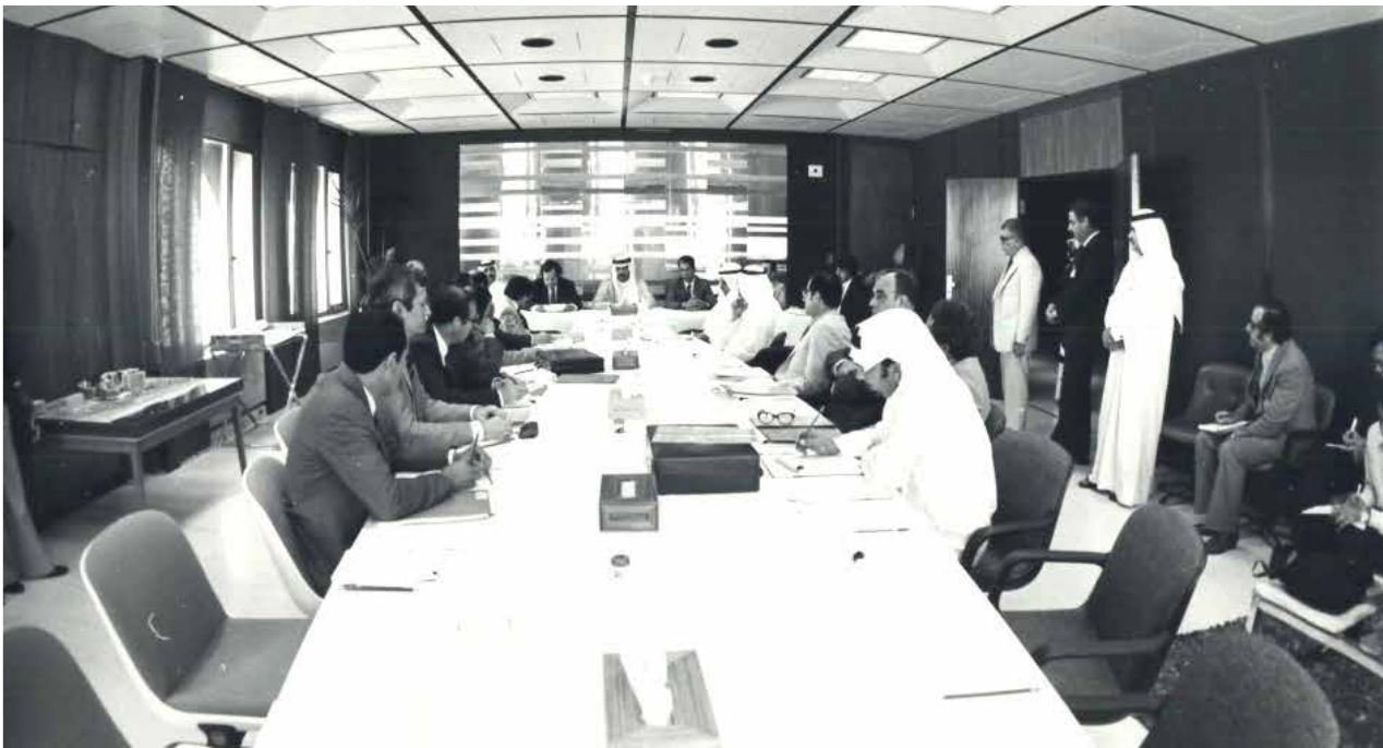
• First Energy Conference, Abu Dhabi, 1979